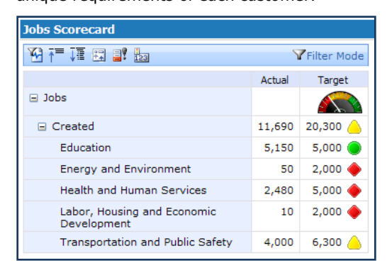
Scorecards highlight progress.

Microsoft Stimulus360 contains rich dashboards equipped with powerful analytics. The interface is spreadsheet oriented for ease of use and may be integrated into existing applications to automate data population. The performance metrics are based on official stimulus guidance and may be extended for the unique requirements of each customer.